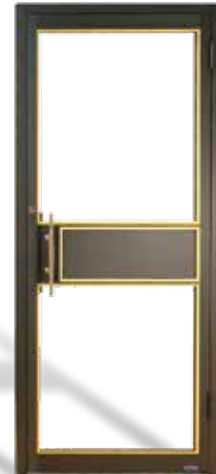
Mid Panel Deco Door