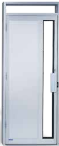
1-1/2" Panel Door