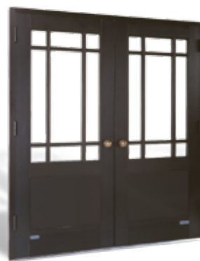
The Park Avenue