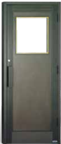
1-1/2" Panel Door

Here are some of your design options. Let REBCO help you harness your imagination.