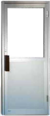
Half Panel Door